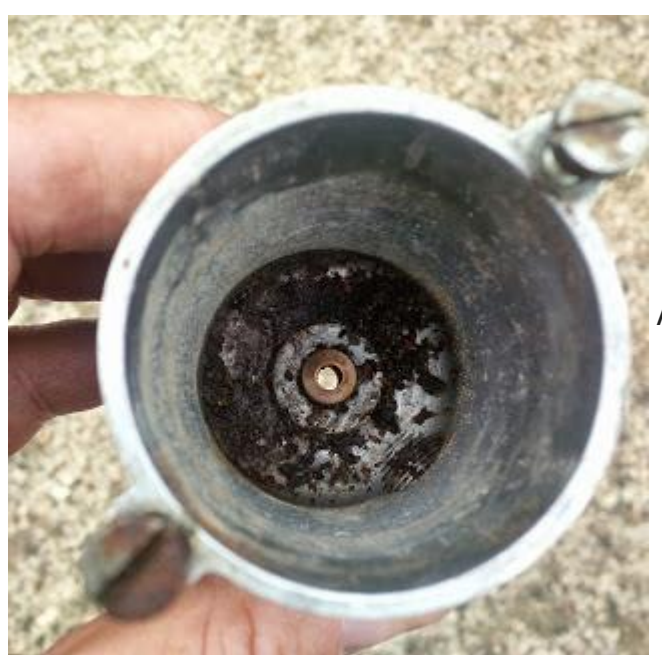
And the float bowl contained this!!