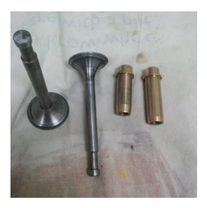
Cylinder head with new valves and guides

2 inlet valves, tulip shape, as removed + new guides, unfortunately wrong size as I ordered the wrong ones hence it was easier for Stu to make the correct ones.