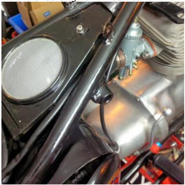
A look inside the airbox

Refurbished original air box cover and new carburettor