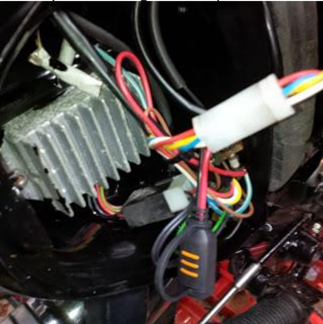
Push fit Battery lead terminals securely mounted Solid state box securely attached to box lid with industrial Velcro Trickle charger socket wired in

Battery box door lock retaining tab modified, courtesy of lump hammer and hacksaw, so that it now remains closed when underway rather than springing half open.