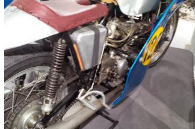
350cc DOHC chain drive twin