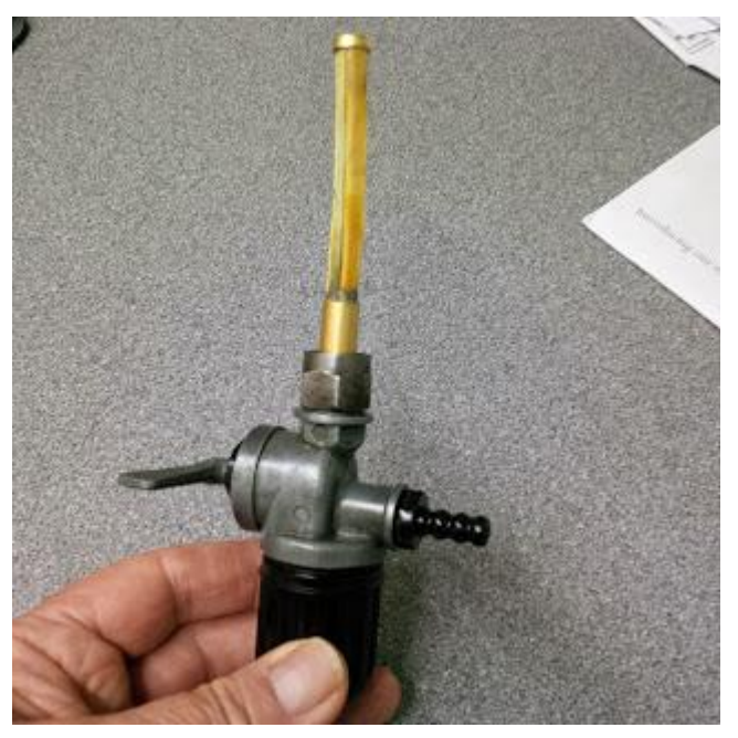
Replacement refurbished original fuel tap with horizontal outlet

Fuel tap. This was a by product of the carburettor saga. More on this in a moment. A complete , refurbished ,original tap has replaced the other original tap due to a horizontal fuel outlet which can accommodate the replacement carb.