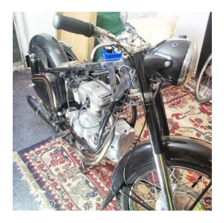
First look with seat and tank off