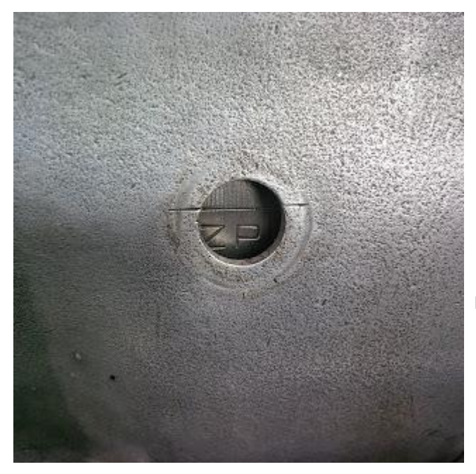
This peep hole reveals 2 stamped settings as flywheel is rotated. Here is ZP Zundepunkt – 10 degrees before further rotation reveals OTP Oberen Tot Punkt - TDC

Study of the power dynamo website revealed a vital missing page from the instruction sheets that came with the bike.