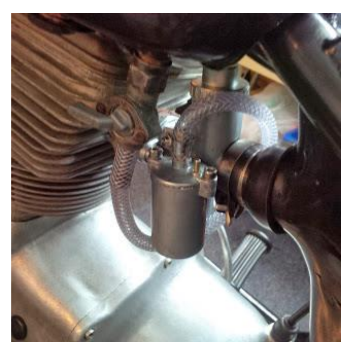
Original Berliner Vergaser Fabrik carburettor

Original BvF – Berliner Vergaser Fabrik carburettor – this attempt failed due to fuel not being able to defy gravity + fuel siphoning out of tickler breathing hole.