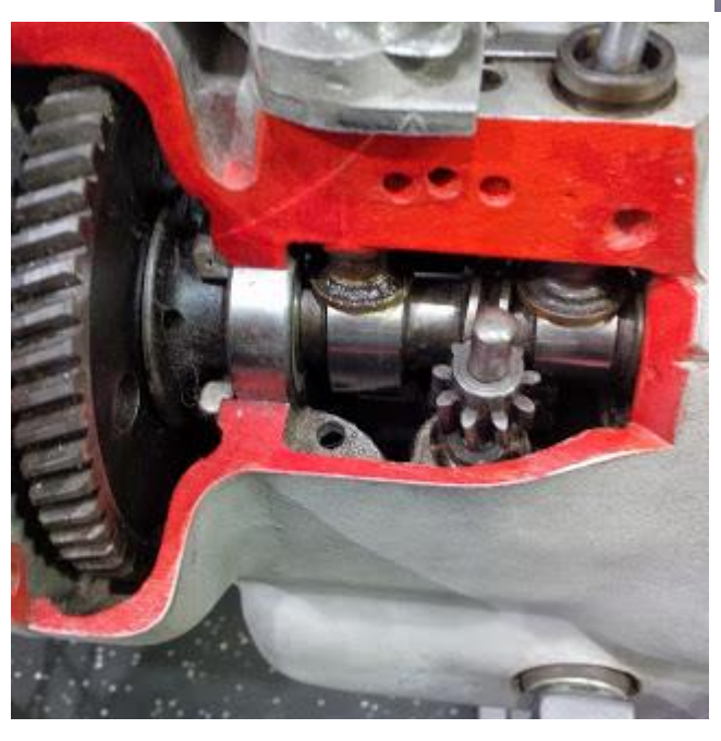
Camshaft and followers to alloy pushrods

A quant touch is that the left side one down three up foot change is positive stop whereas the hand change lever, a left over from the original 1923 engine / transmission layout, is not. This lever describes a long arc dependent upon which gear the gearbox is in. It is nonetheless handy at a standstill to select neutral as shown by the green neutral light on the headlamp shell. On this machine the original 6 volt electrics have been replaced by a 12 volt power dynamo conversion which dispenses with the original contact breakers and mechanical auto timing device. The machine has ignition light, parking light, brake light in addition to the headlight and horn.