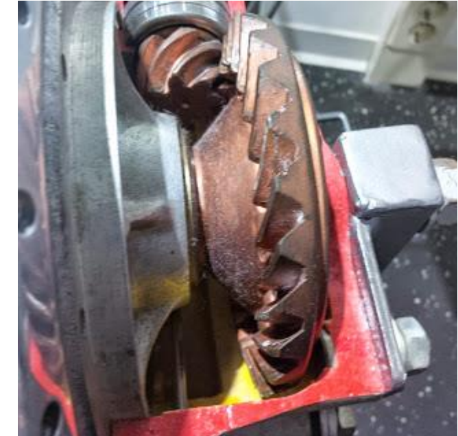
Final bevel drive