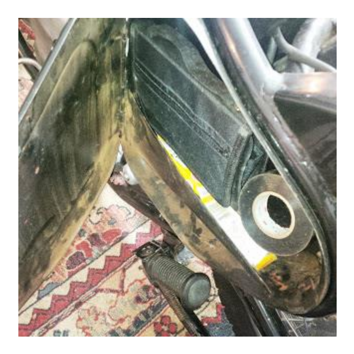
Inside tool box