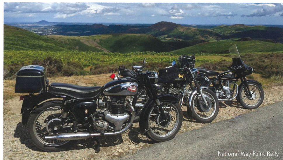
National Way Point Rally